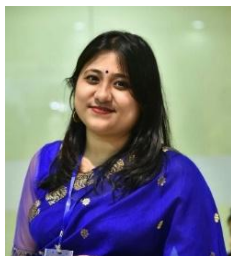
Contributors: Brishti Saikia, APS and Mouchumi Dutta, PS, KVK Lakhimpur